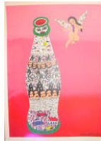
Coke Angel by Howard Finster "Outsider Artist"