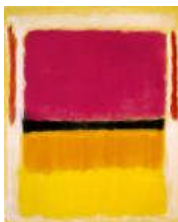
Art by Mark Rothko.