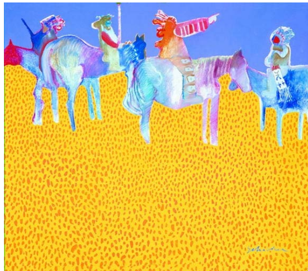
Four Indian Riders Fritz Scholder 1967 Oil on canvas http://xrl.in/4hdm